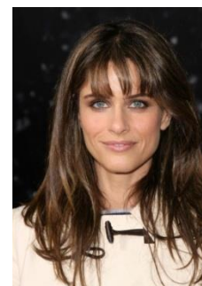
Amanda Peet Actress