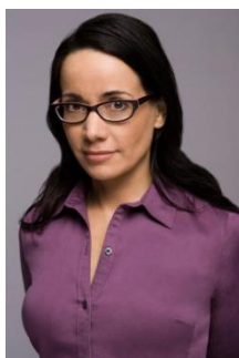
Janeane Garofalo Stand-up comedian, actress, liberal political activist, and writer.