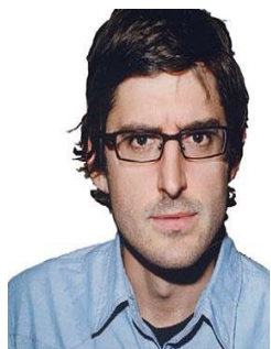
Louis Theroux Journalist