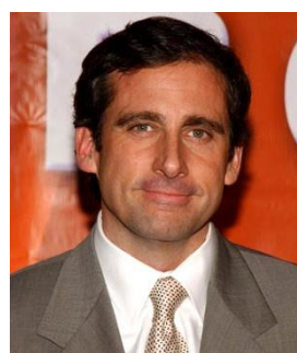
Steve Carrell Actor